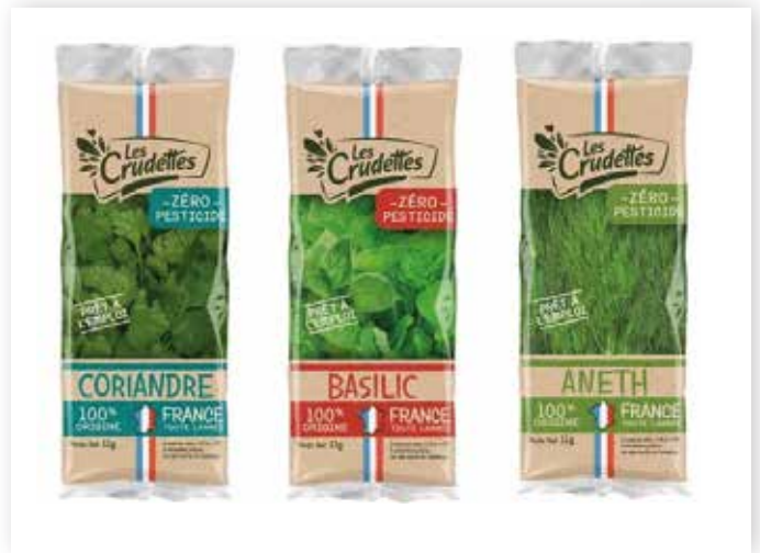
Some of the packaged varieties they produce, grown with our system.

To solve these issues they decided to integrate vertically and start to produce their own aromatic herbs right next to their processing plant.