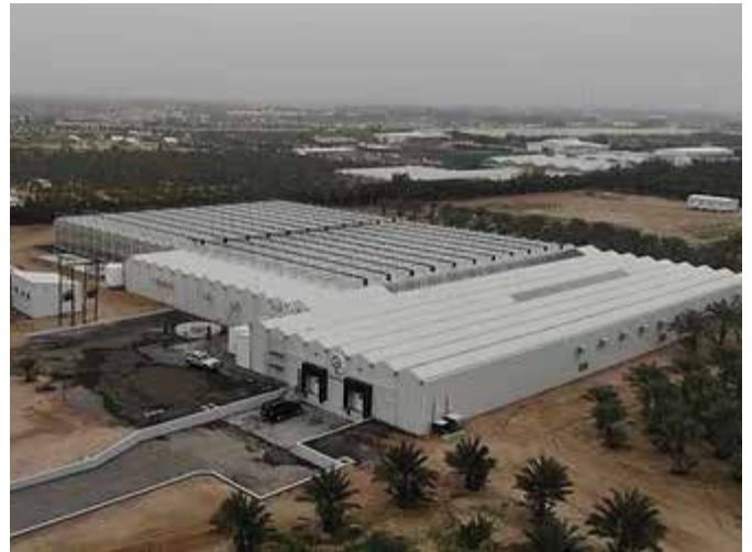
A custom-designed AEROponics Greenhouse.

One of the main objectives was to significantly minimize water use in agricultural production in the region: AEROponics turned out to be the ideal investment since it saves 96% of water compared to the open field, which not only reduces the bill but with so little water in the system it also allows them to cool down the nutrient solution before it's sprayed on the roots, making it possible to grow consistently in such a hot environment.