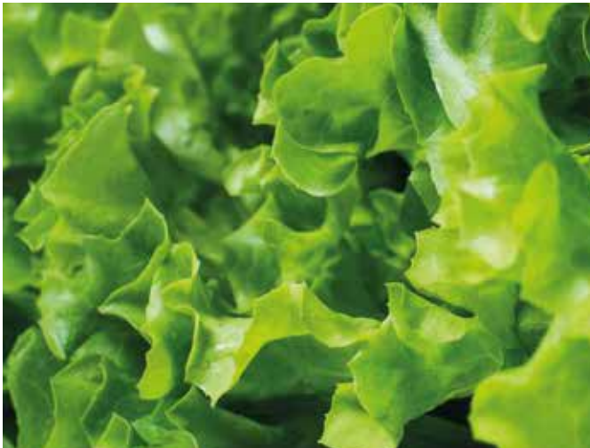
Lettuce produced with our GREENOVA AEROPonics system.