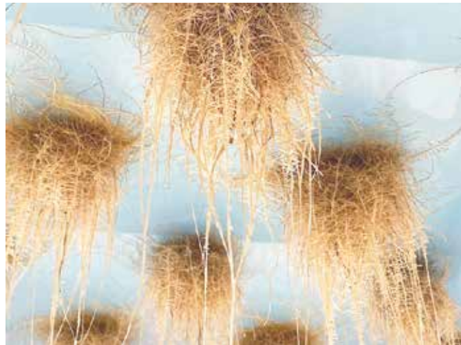
Healthy roots with GREENOVA AEROpionics system.