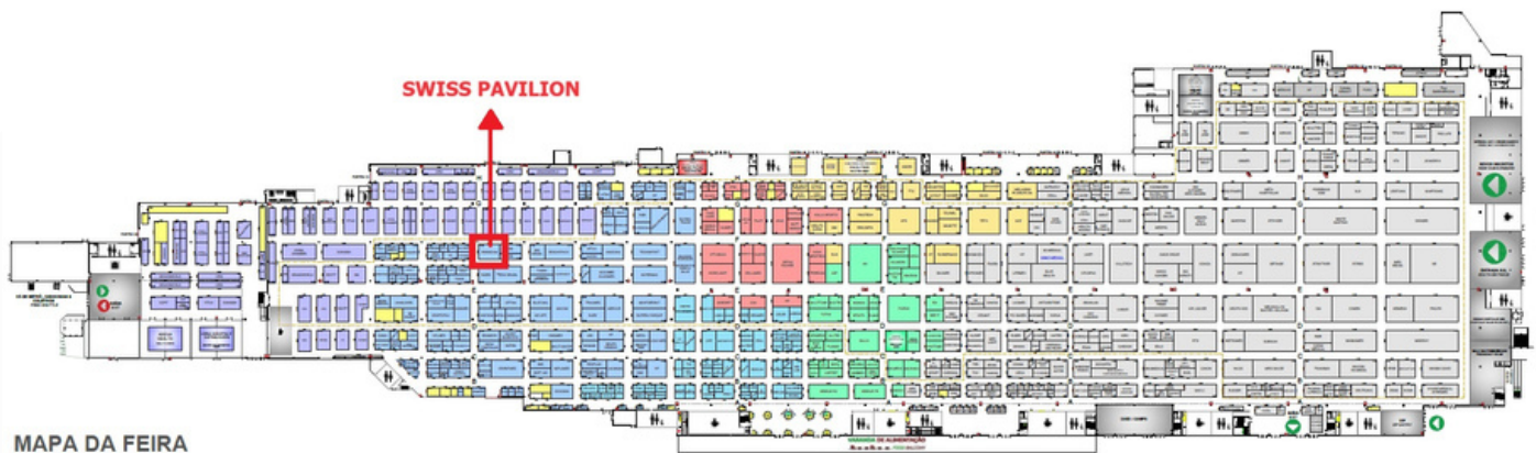
MAPA DA FEIRA FLOOR PLAN

Swiss Pavilion: SWISSCAM organizes a collective stand for Swiss and Liechtenstein companies at the 29th Hospitalar, located in one of the most privileged areas. We currently designed-to-order booths from 6sqm, already equipped with a counter, side table and 3 chairs, a garbage can and 2 outlets of 220V . The Pavilion also has a common area (Swiss Lounge) with full time catering service.