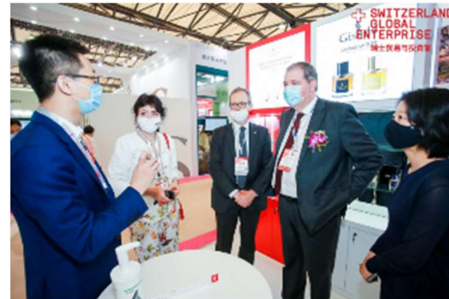
Pictures for reference only.